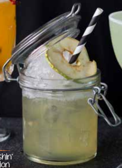
Appley Ever After